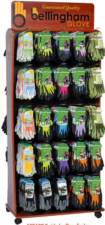
SCGARD 2-sided rolling display